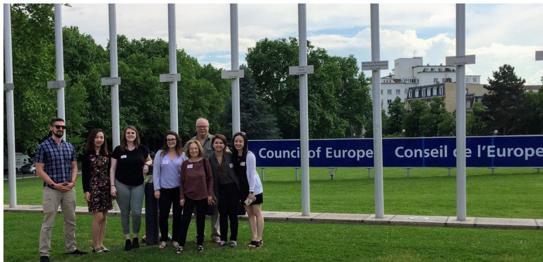
Council of Europe