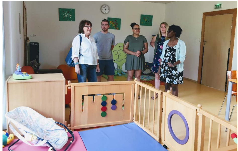
Above: SU students visiting Foyer départemental de l'enfance, Strasbourg, France in 2017. It is a public agency offering residential care for children in foster care.