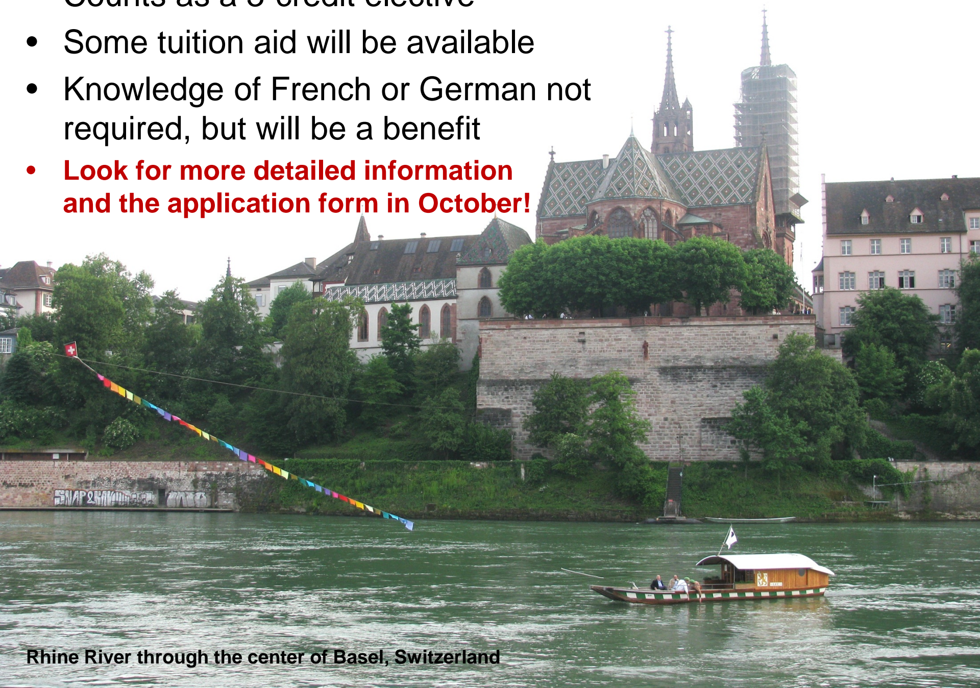
Rhine River through the center of Basel, Switzerland