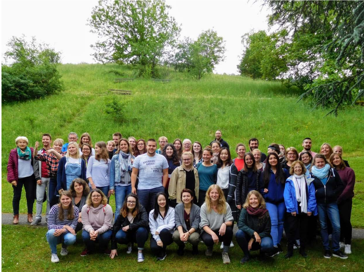
French, German, Swiss, and American Students and Faculty at the RECOS Seminar May, 2018