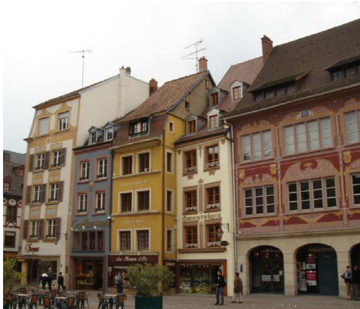
Historic central plaza, Mulhouse, France

First week RECOS Accommodations: A retreat facility near Freiburg, Germany