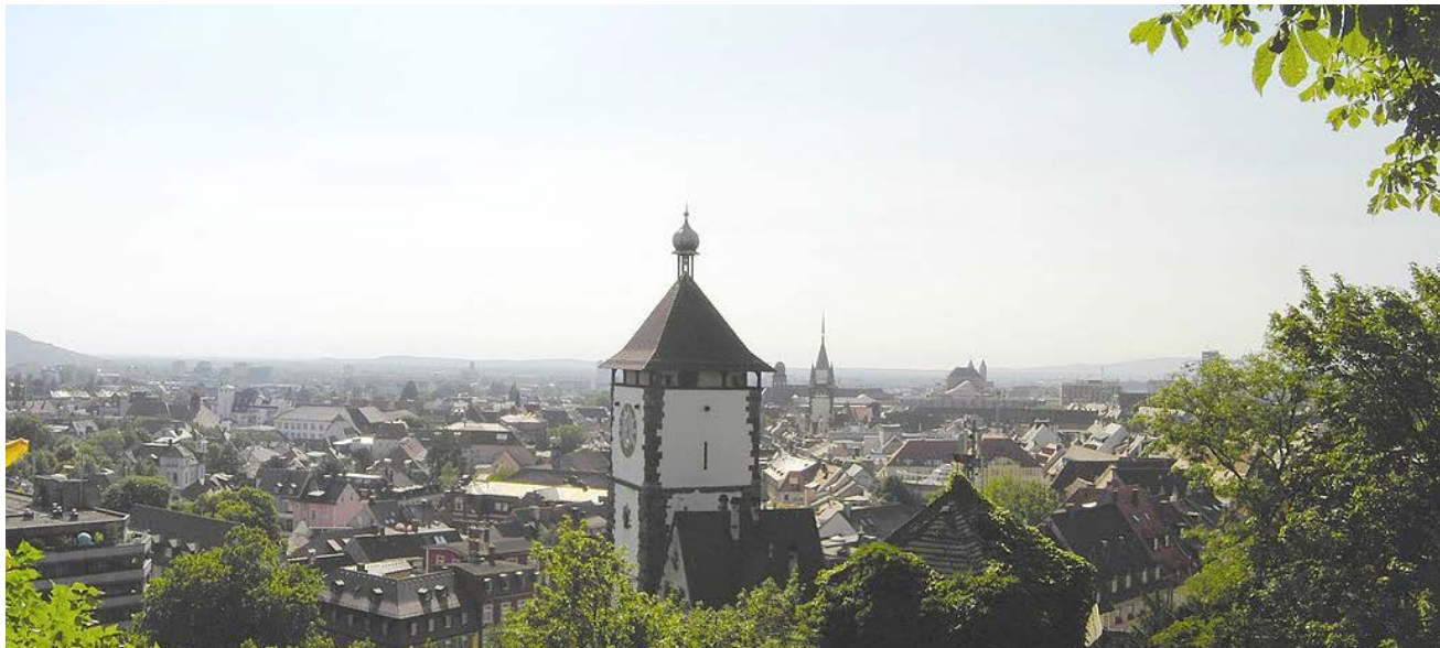
View of Freiburg, Germany from one of its hills

Agency visits: Mulhouse, France Freiburg, Germany & Basel, Switzerland