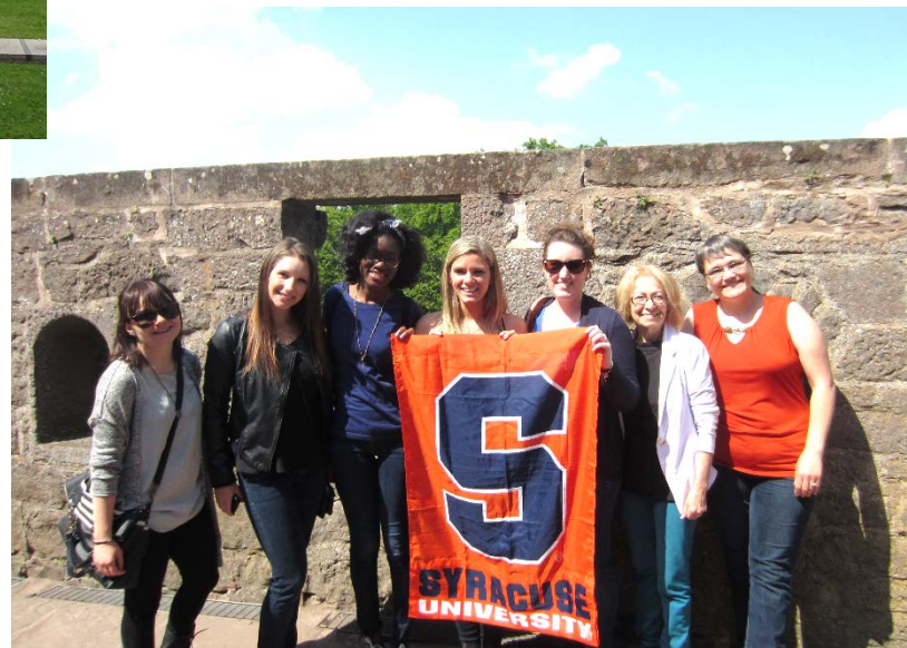
On the ramparts of the castle, Haut-Koenigsbourg

Accommodations: Hotel Citadines near Place Kléber