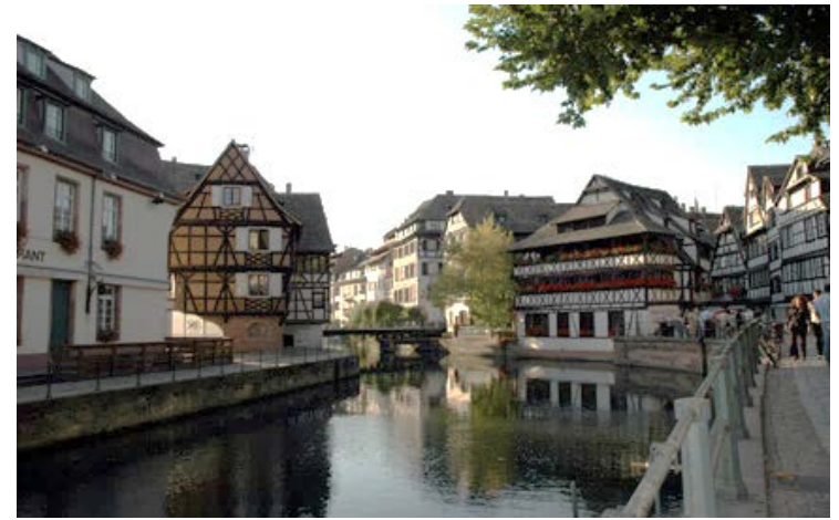
Le Petit France neighborhood in Strasbourg