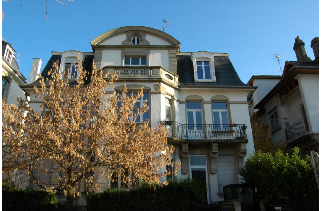
Université de Syracuse, Strasbourg