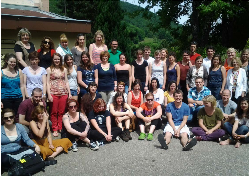
French, German, Swiss, and American Students and Faculty at the RECOS Seminar 2014

An Opportunity for Spring to Keep in Mind!